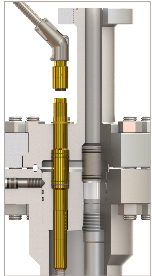
Rubber molded Wellhead Feedthru: surface and penetrator

These feedthrus are most commonly installed from below the tubing hanger, and secured above with a retention nut. With a separable surface connector on top, work-overs are fast and easy. The Rubber Molded 2-Piece System is a vulcanized elastomeric system, recognized for superior performance.